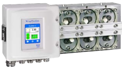
KLDS-8 with SR6 meter block